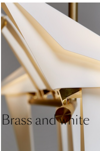
Brass and white