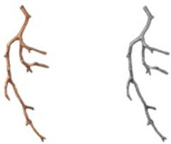
Copper (CO) Lead (CH)