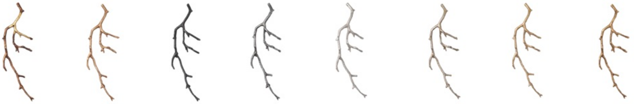
Talha (TA) Rose Gold (RO) Black (PR) Palladium (PL) Silver/White Patina (FP/PB) Silver (FP) Gold/White Patina (FO/PB) Gold (FO)