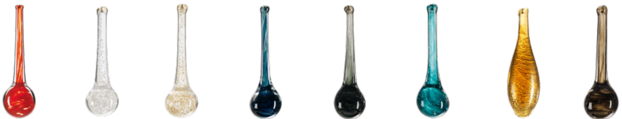
Cherry Red (45) Silver (44) Gold (43) Dark Blue (42) Grey (41) Blue Sea (39) Amber Gold Leaf (36) Smoked (34)