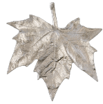
Silver/White Patina (FP/PB)