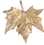
Gold/White Patina (FO/PB)