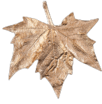
Rose Gold (RO)